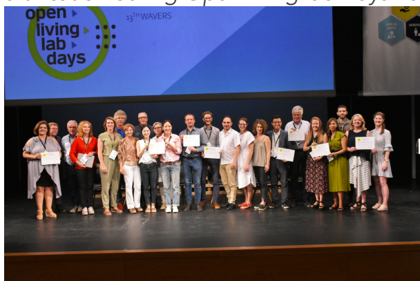
13th Wave Members receive their ENoLL Certification during OpenLivingLab Days 2019

https://enoll.org/about-us/how-to-become-a-member