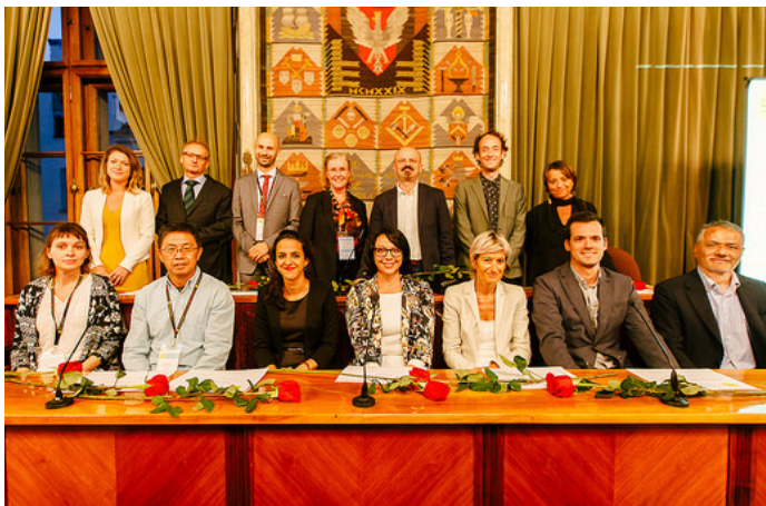
12th Wave of Membership

For further information please visit www.openlivinglabs.eu or contact info@enoll.org